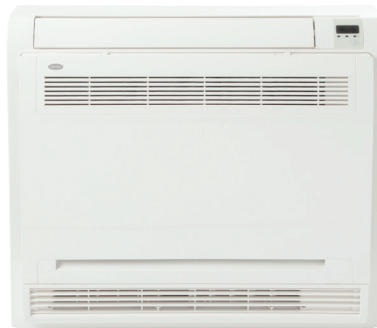
40MB*F Floor Console

For Indoor Unit performance information, please reference the Carrier Ductless Full Line Catalog.