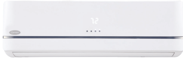
40MA*Q High Wall

THE 38MA*R OUTDOOR UNIT SINGLE ZONE IS COMPATIBLE WITH VARIOUS STYLES OF INDOOR UNITS, WHICH CAN BE SELECTED BASED ON THE APPLICATION.