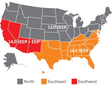
*12.2 EER < 45,000 Btu/h, 11.7 EER ≥ 45,000 Btu/h

On January 1, 2015, a new set of minimum efficiency standards took effect. Under the new standards, there are different efficiency minimums for air conditioners in each of three regions - North, Southeast and Southwest. Your Carrier<sup>®</sup> dealer will have a Performance<sup>™</sup> Series air conditioner to meet your region's minimum requirement.