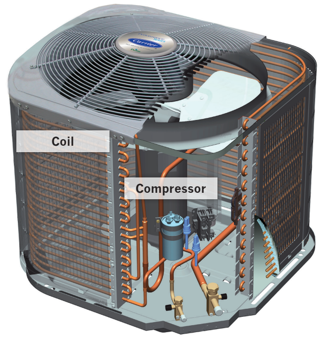
Performance<sup>™</sup> 17 Air Conditioner Shown

Wi-Fi® is a registered trademark of the Wi-Fi Alliance Corporation.